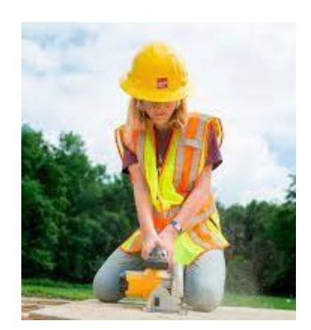
Tools - Hand and Power