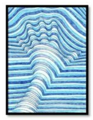
↑ Step 5: Choose three colors, using a color scheme, and color between your black lines using colored pencils.