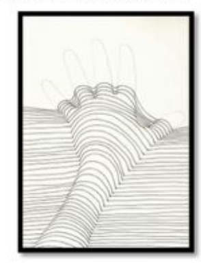
↑ Step 3: Continue adding lines and moving up the paper towards the top. When doing the fingers, curve your lines in the opposite direction instead of adding straight lines.