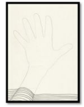
↑ Step 2: Start at the bottom of the page where your arm is and draw a curved line on the arm and then straight lines for the background.