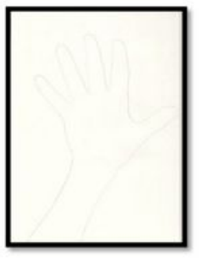
↑ Step 1: Trace your hand lightly using a pencil. Do this step as lightly as possible because your original outline of your hand should not show when finished.