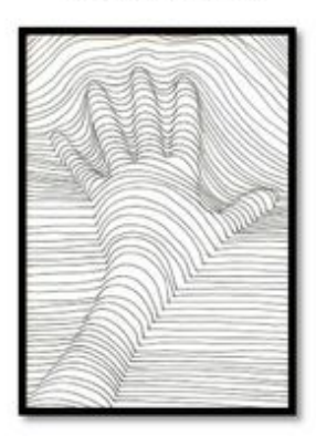
↑ Step 4: The most difficult part of this project is ending the fingers. Try to flatten out your background line as much as possible so it no longer matches the curve of the fingers.